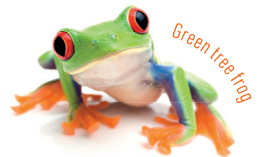
Green tree frog

It's thought there are about 8.7 million different animal species in the world, though only 2.1 million have been found and named so far. Can you imagine inventing millions of animals? Just because humans could never do this, it doesn't mean God couldn't. God really is that powerful!