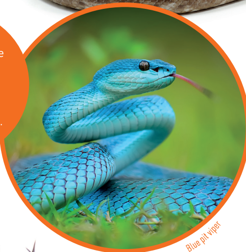
Blue pit viper

Reticulated pythons are the longest snakes. In 1912 one was measured at 10 metres (33 feet) long!