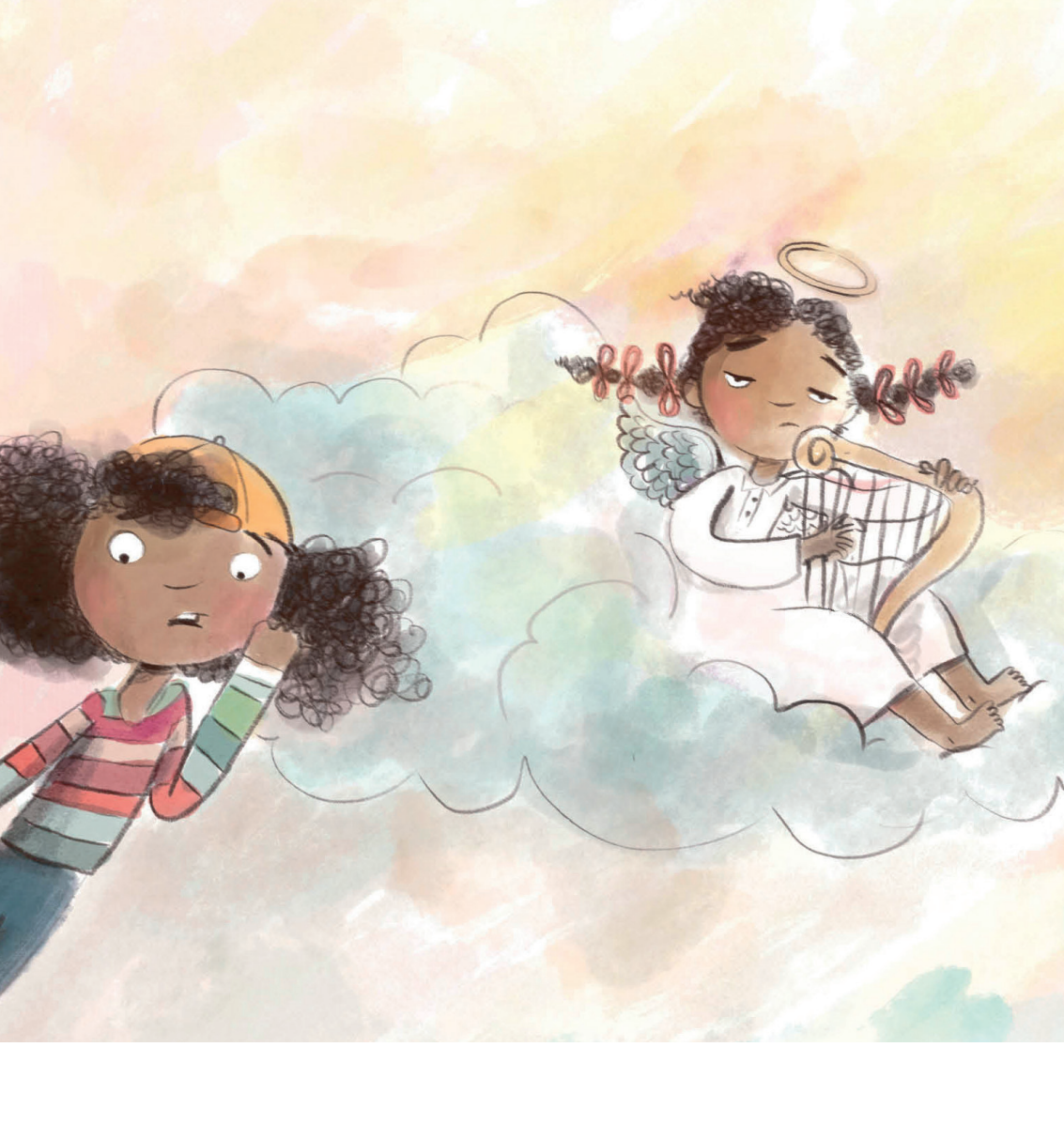
What is heaven like?