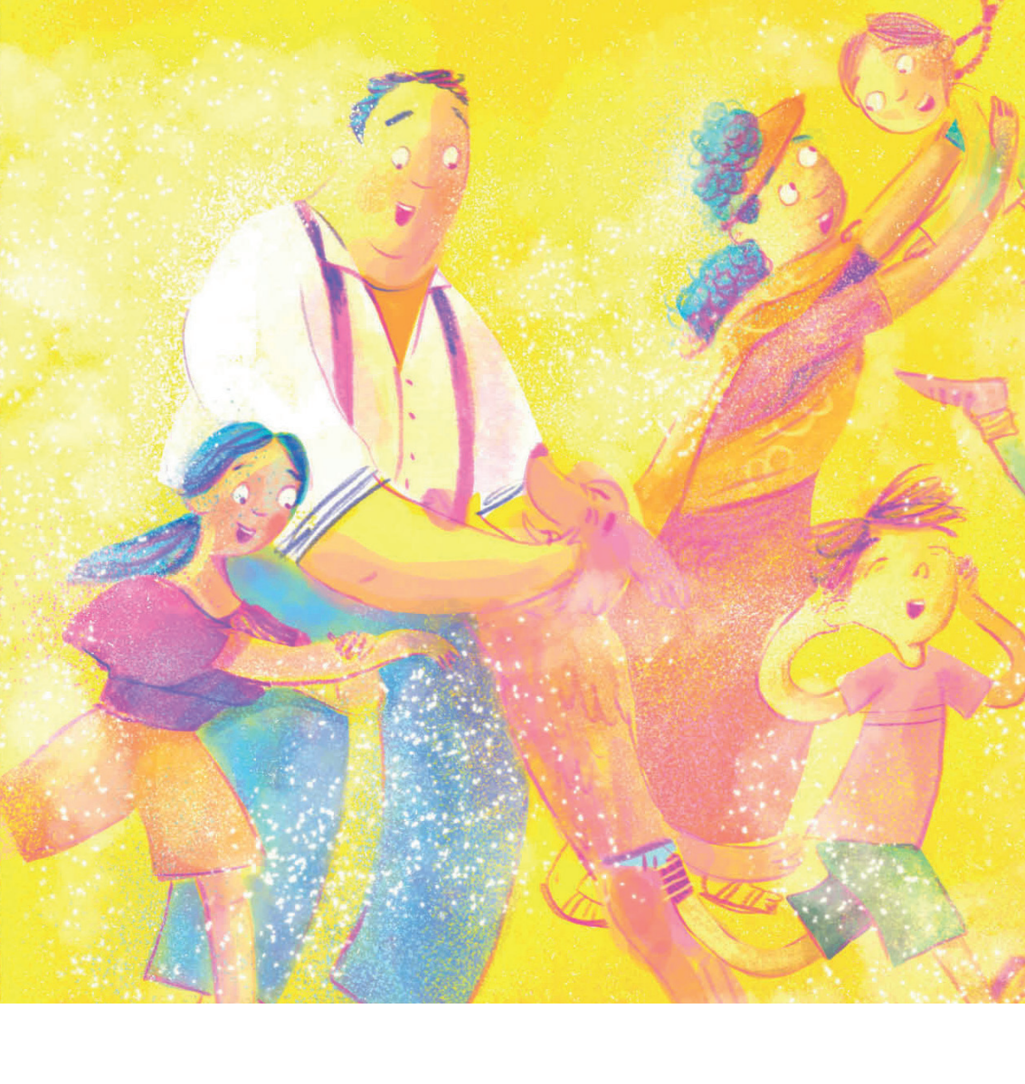
We will have new bodies.