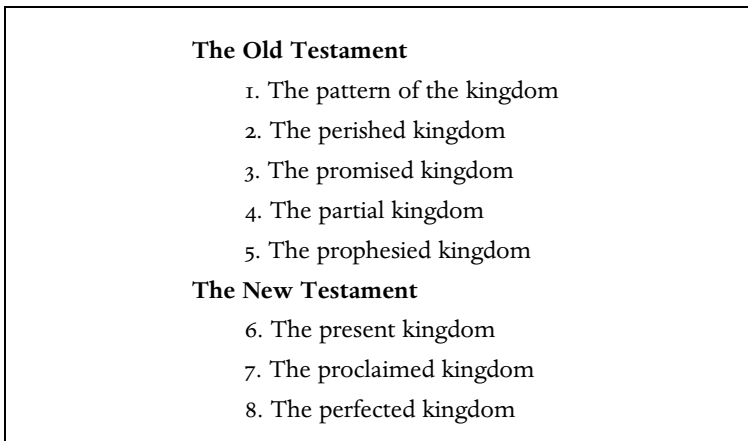
Figure 6. An overview of the Bible

When I studied English literature at school I found it a great help to buy a study guide to whichever book I was reading. It would always give a synopsis of the main sections, which summarized a long book in just a page or two. (See Figure 6.) I have divided the Bible into eight sections, which are the main epochs in God's unfolding plan to restore his kingdom. The names I have given these sections provide the chapter