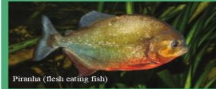
Piranha (flesh eating fish)