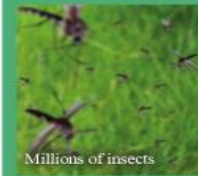
Millions of insects