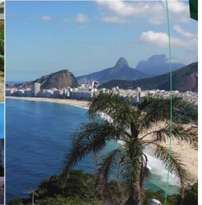
A. Copacabana Rio de Janeiro Brazil. B. Donkey on road in rural Demerara (now Guyana). C. Downtown Buenos Aires Argentina at night