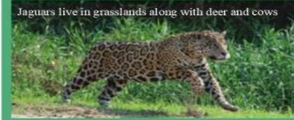
Jaguars live in grasslands along with deer and cows