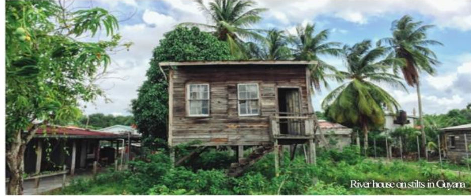
River house on stilts in Guyana