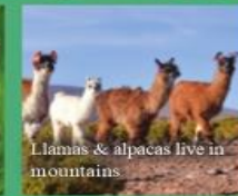
Llamas & alpacas live in mountains