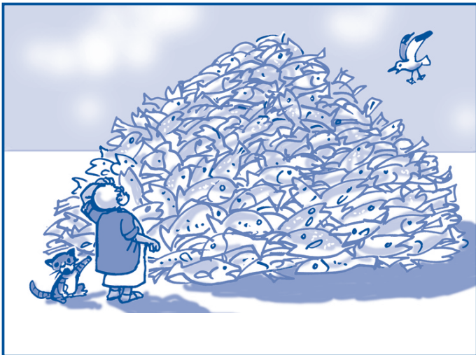
The catch of the day!

Local fishermen J _____, J _____ and S _____ brought in a huge catch yesterday. Apparently a carpenter gave them some advice that paid off big time!