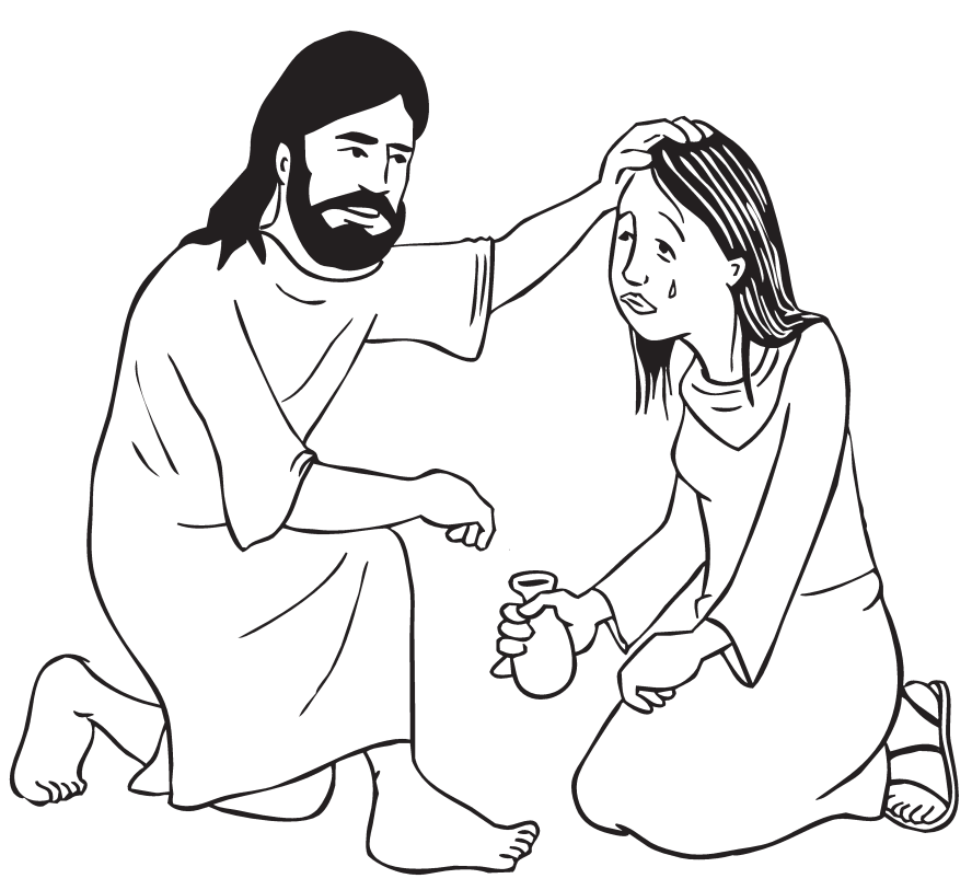
© The Good Book Company 2005

The purchaser of CLICK Unit 1 (8-11s) is entitled to photocopy this page for use with his or her group.