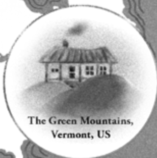
The Green Mountains, Vermont, US